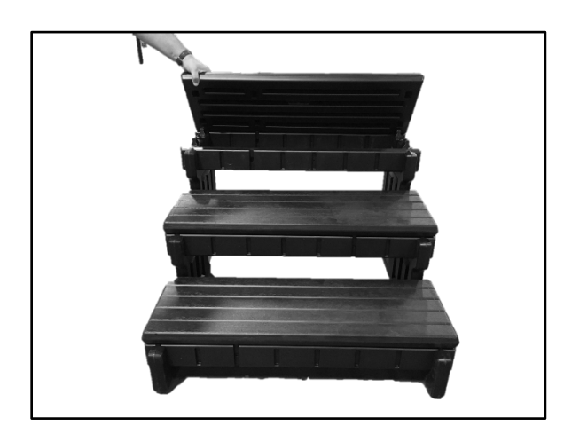
Step 4: Install the steps (finished edge out) by placing over the male lugs on the step sidewall and hitting downward with a rubber mallet. If the treads don't fully engage onto the lugs it may be necessary to step on the tread directly over the lugs and force down with your foot.