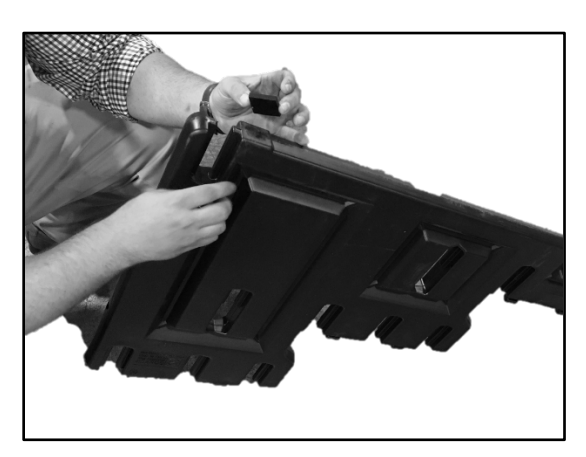
Step 1: Install the foam pads (4) on the flat spots located on the bottom edge of the side wall