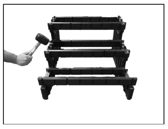
Step 3: Turn the step assembly over and finish installing the 3" supports into the front and back slots of each step location